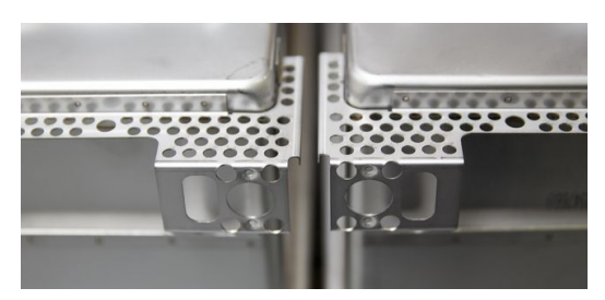
Formed areas – like brackets, threads and hinges – are now made up quickly and easily on the TruMatic 6000 fiber.