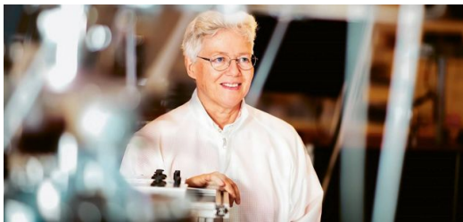
Professor Anne L’Huillier helped found the field of attosecond laser physics. This work may soon shine a light on the world of electrons.

L’Huillier: It’s hard to give a well-defined vision. But that’s how it is with basic research.