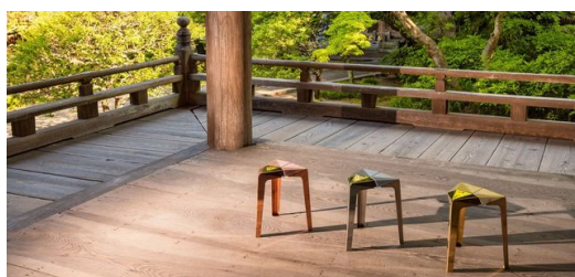
<p>The "Orisu" chair is something special: it makes abstract technologies visible to the viewer.</p>