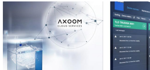
Some of the data is uploaded to the AXOOM Cloud via the Internet.