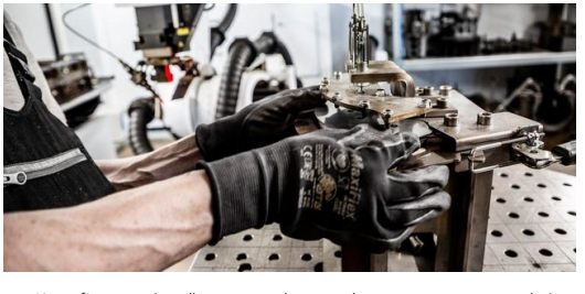
<empf's managing directors used success bonuses to encourage their employees to identify parts suitable for automated laser welding. This boosted their motivation, and now even fixture construction is easy.