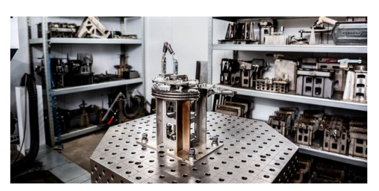
Even with simple sheet metal fixtures, components can be clamped in