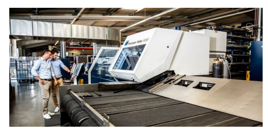
In addition to laser tube processing with the TruLaser Tube 5000, Kevin and Marcel Kempf now also have automated laser welding in their portfolio. With the help of the TruLaser Weld 5000, they were able to expand their customer base even further.

such a way that they can be processed automatically with the TruLaser Weld 5000 laser welding system.