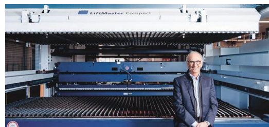
In combination with the LiftMaster Compact and the Part Master, the system cuts the parts fully automatically at the refrigerator manufacturer's