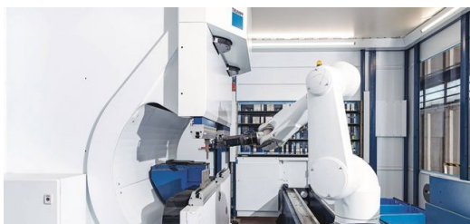
Innovative high-speed bending cell: The TruBend Cell 7000 is a compact system that offers highly dynamic, cost-effective bending solutions for small

The company was founded in 1982 by José Júlio Jordão in the city of Guimarães, in northern Portugal. What started out as a team of 22 people has since grown more than tenfold to a workforce of 250. Today, Jordão is one of Europe's leading manufacturers of standard and tailored refrigeration equipment for food retail and the hospitality sector with customers all over the world and a most recent turnover of 21.5 million euros.