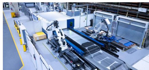
A general view of the TruLaser 8000 Coil Edition: This picture shows how much less sheet metal waste is left over when Fendt cuts from the coil instead of the sheet.