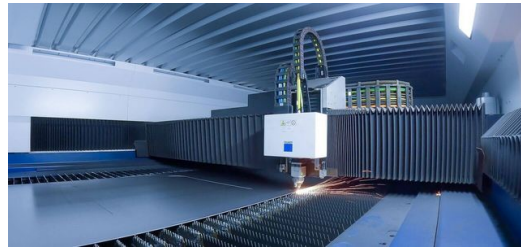
The laser head whizzes over the seemingly endless sheet metal strip and cuts the contours of the outer surface parts of the Fendt tractors.