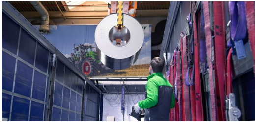
One crane lift cycle now replaces five forklift truck trips - an immense gain in productivity.