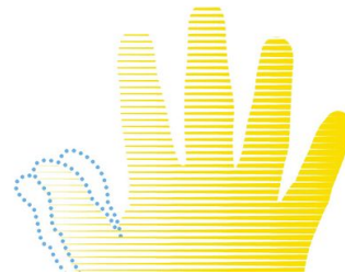
<p><span lang="EN-US">Karl Deisseroth opts to experiment on himself using transcranial magnetic stimulation</span></p><p><span lang="EN-US">—</span><span lang="EN-US">his thumb twitches. - Gernot Walter</span></p>