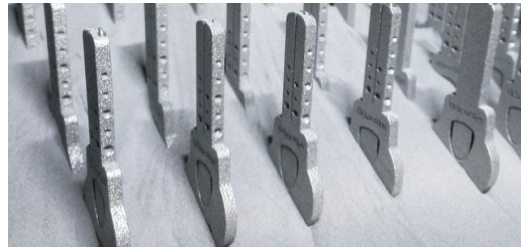
The 3D printing process enabled the young engineers to completely redesign the traditional key.

The more researchers discover about laser light and how it works, the more these findings give rise to ideas for applications and business concepts. Similar to the famous “Stanford boys” of Silicon Valley, many of this latest batch of start-up founders are post-grads and post-docs who spin off a market-able idea from their research work and then team up with venture capitalists who have their eye on a profitable investment. The fact that these ideas stem from general research rather than a narrowly-framed user problem makes them more diverse than ever before.