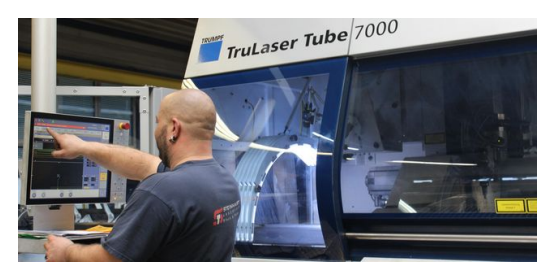
The finished program appears on the machine operator's terminal.