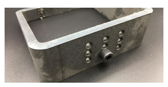
The TruLaser Tube 7000 can be used to fabricate a range of different threads in tubes.

Since the summer of 2017, the company's plant in the Swabian Jura region has been using a test unit of the TruLaser Tube 7000 laser tube cutting machine with integrated tapping system. "We are delighted to be working with TRUMPF on this kind of collaborative project, and we are certainly impressed with the new technology," says Frank Steinhart. The CO2 laser cuts tubes and profiles without leaving burrs and offers bevel cuts of up to 45 degrees, diameters up to 254 millimeters and wall thicknesses of between one and ten millimeters.