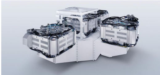
Since the beginning of 2014 TRUMPF has delivered its third-generation laser systems to ASML in Netherlands, the only manufacturer of EUV photolithography systems in the world.

Secondly, it is only the wavelength of 13.5 nanometers that makes it possible to manufacture the layer systems required for optical imaging at sufficiently high reflectivity. Refractive optical elements – such as lenses – absorb this wavelength. That is why EUV systems work exclusively with mirrored optical elements. The very short wavelength is also the reason why the entire process has to take place in a vacuum, since air would also absorb the EUV radiation.