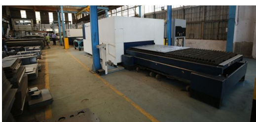
Lightweight doesn't always need high strength steels: JBM uses this TruLaser 1030 to produce profiles for buses.