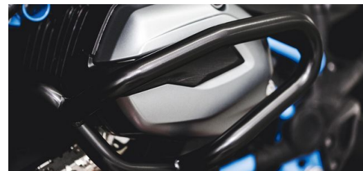
IBEX aims to make everything people need for their motorcycles out of sheet metal. These crash bars are just one example of what the company offers.