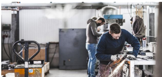
In 2015 IBEX moved into a 2,300 square meter production hall with an attached office in Dresden.