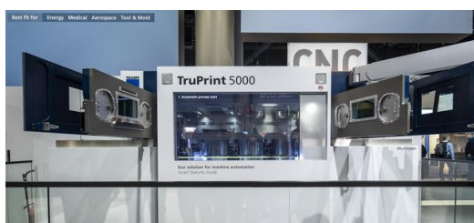
The TruPrint 5000 featuring auto-start

The large-format TruPrint 5000 system featuring auto-start was an eye-catcher. This solution speeds up 3D printing to boost productivity. The Formnext demo showed visitors how the substrate plate with a zero-point clamping system automatically slides into the proper position. Speaking at the press conference, Tobias Baur, General Manager of TRUMPF Additive Manufacturing, said that automated in-machine solutions like this are the first step toward the longer-term goal of automating upstream and downstream stages in 3D printing.