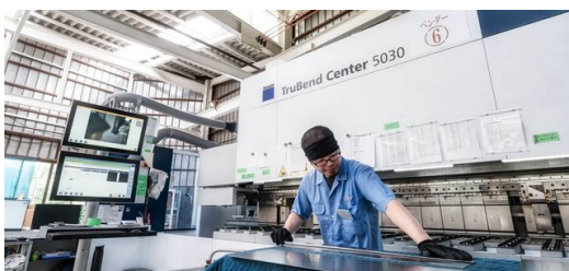
An employee working with the TruBend Center 5030 : This is how the "Orisu" chair is made.