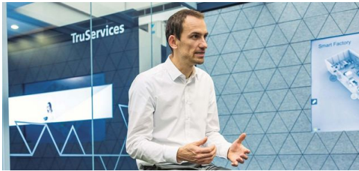
Explaining AI: The TRUMPF computer vision expert is happy to explain how AI can improve sheet-metal cutting.