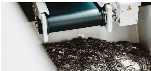
Material-saving: The TruPunch 5000 reduces rejects to a minimum.