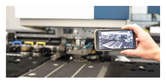
<span lang="EN-US">Remote diagnosis and error correction using the Visual Assistance function integrated into the TRUMPF Service app allows TRUMPF technicians to connect to the customer's cell phone or tablet camera.