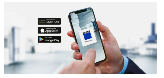
<span lang="EN-US">The TRUMPF Service app is available for download from Google Play or the Apple App Store.