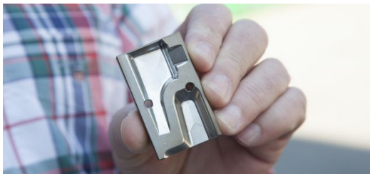
The molded gripper forces the blanks into a defined position, aligning them with the laser machine’s reference system.