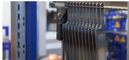
Following contour cutting, the blades wait for pins to be fitted and then go for grinding and hardening.