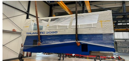
Heavy freight: The seven ton heavy bar arriving at the Matyssek Metalltechnik assembly hall.