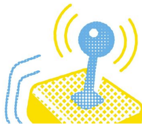
<p><span lang="EN-US">This form of remote control actually feels surprisingly fine. </span></p>