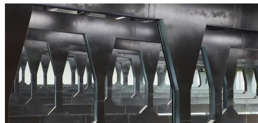
The Skywalk is part of the cantilevered ceiling structure that is manufactured by a TRUMPF customer in Atlanta.