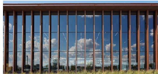
The focus of the Smart Factory is to advise and train customers on the introduction of digitally connected production solutions.