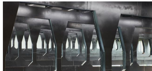
The Skywalk is part of the cantilevered ceiling structure that is manufactured by a TRUMPF customer in Atlanta.