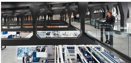
A bird's-eye view of the factory reveals a catwalk, the so-called "Skywalk": Spanning the full length of the 55-meter-long hall, with its material and information flow, it emphasizes the fact that the production facilities constitute a single, overall system.