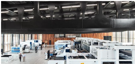
In a production hall measuring 55 meters in length, there is a connected sheet metal production with a central storage system as the centerpiece, which supplies the machine tools with material.