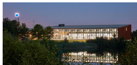
The construction costs of the 5,500 square meter building estimated at about 13 million euros. It was designed by the Berlin architectural office of Barkow Leibinger.