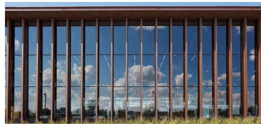
The focus of the Smart Factory is to advise and train customers on the introduction of digitally connected production solutions.