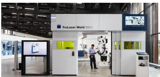
The production line is designed in such a way that entire real production processes can be carried out.