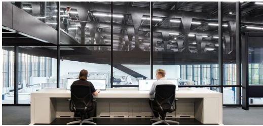
The Industry 4.0 offerings at TRUMPF are all subsumed under the name TruConnect. All the key TruConnect modules are in operation at the Chicago plant, enabling comprehensive demonstration of production according to the principles of Industry 4.0.