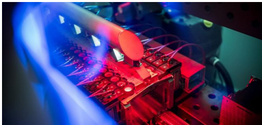
<p>Thanks to the boom in battery modules, BBW Lasertechnik has had to expand its production facilities twice in a short space of time.</p>

Because it's impossible to develop everything in-house, BBW Lasertechnik also collaborates on international research projects. As part of the LaserComposite research project, funded by a German government innovation program for SMEs, the company looked into the use of green and infrared lasers for welding aluminum-copper hybrid joints. BBW Lasertechnik was able to show that this method largely prevents the two metals from mixing in the seam to form unwanted intermetallic phases—i.e., alloys. In another—inhouse—development project by the name of Weldshape, the company tackled the problem of hot cracks that arise when welding the aluminum alloy AW6060, which is highly prone to this issue. The solution is to use dynamic beam shaping in a process based on a self-constructed laser system featuring a 16 kW single-mode laser and high-end scanner.