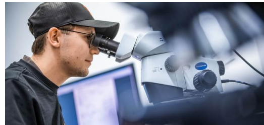
<p>Tireless efforts to enhance and innovate — that keeps customers happy and won the company a "Bavaria Best 50" award in 2023.</p>