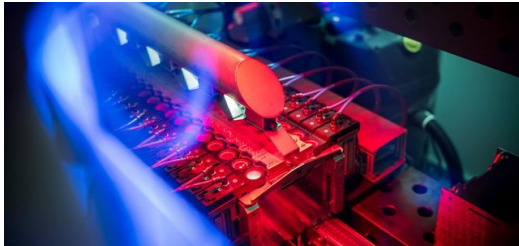
Thanks to the boom in battery modules, BBW Lasertechnik has had to expand its production facilities twice in a short space of time.

Because it's impossible to develop everything in-house, BBW Lasertechnik also collaborates on international research projects. As part of the LaserComposite research project, funded by a German government innovation program for SMEs, the company looked into the use of green and infrared lasers for welding aluminum-copper hybrid joints. BBW Lasertechnik was able to show that this method largely prevents the two metals from mixing in the seam to form unwanted intermetallic phases—i.e., alloys. In another—inhouse—development project by the name of Weldshape, the company tackled the problem of hot cracks that arise when welding the aluminum alloy AW6060, which is highly prone to this issue. The solution is to use dynamic beam shaping in a process based on a self-constructed laser system featuring a 16 kW single-mode laser and high-end scanner.