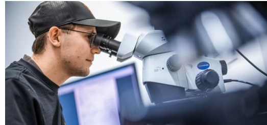
Tireless efforts to enhance and innovate — that keeps customers happy and won the company a "Bavaria Best 50" award in 2023.