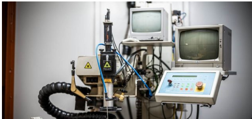
Proven technology remains in service. In parallel, BBW Lasertechnik continues to invest in the latest laser systems and steadily expand its portfolio.

Beam shaping? Correct. BBW Lasertechnik is at the very cutting edge of laser processing. Beam shaping is naturally part of that mix. As Bürger explains, of the 50 or so laser systems in operation at BBW Lasertechnik, a number of them are earmarked for developing this technology. "There's a lot riding on beam shaping. It provides a way of dealing with a number of thorny issues, such as ensuring that the weld pool remains stable during laser welding. At BBW Lasertechnik, what we really need is variable beam shaping. That's because fixed optics are not economical for the small batches that we produce for our niche markets."