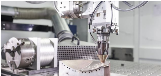
The LMD process shown here on a TRUMPF system is suitable for repairing large parts and developing prototypes in the aerospace sector.