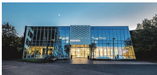
<p>Customer center: TRUMPF impresses customers with its combination of outstanding industrial architecture and superb product quality.</p>