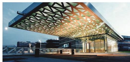
<p>Main entrance and reception: A glance at the ceiling is all it takes for visitors to see that TRUMPF machines are the perfect choice for laser-