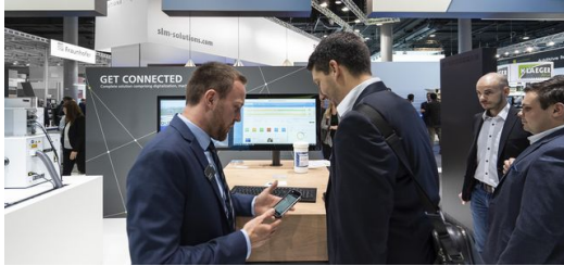
<em>All 3D printers at the exhibition stand were connected to a digital MES</em>

learn how much it will cost to produce the component and how long delivery will take. On top of that, the manufacturer can access the printers and the pending jobs' process data from anywhere in real time.