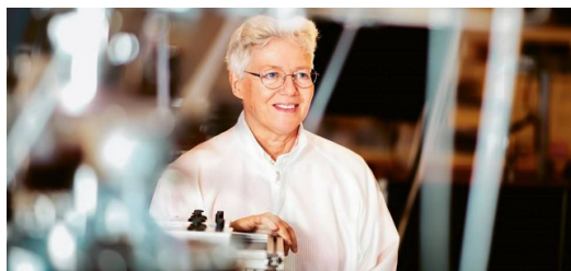
Professor Anne L’Huillier helped found the field of attosecond laser physics. This work may soon shine a light on the world of electrons.

L’Huillier: It’s hard to give a well-defined vision. But that’s how it is with basic research.