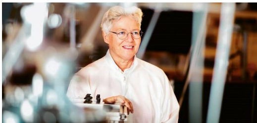
<p>Professor Anne L’Huillier helped found the field of attosecond laser physics. This work may soon shine a light on the world of electrons.</p>

L’Huillier: It’s hard to give a well-defined vision. But that’s how it is with basic research.