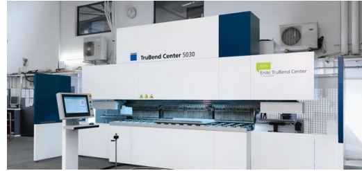
Since December of 2014 the first TruBend Center, built by TRUMPF, has been on site at Bickel Blechtechnik. There it makes for previously unconceivable diversity in the parts it produces.