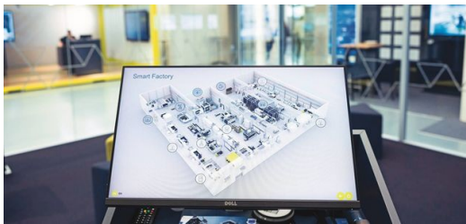
Machine data collected by TRUMPF in its smart factory helps the computer vision team to train the AI.

In this business model, TRUMPF’s fully automated flagship is located at the customer’s site, where it produces the desired parts; but control of the machine lies in the hands of a TRUMPF team at the Neukirch site in Saxony, which operates in three shifts, including at night. The cameras keep the team updated on every aspect of the machine’s operation and deliver a non-stop stream of data. If a sheet-metal part gets stuck, the cameras record a short clip starting a few seconds before the event and ending a few seconds after. This helps the AI learn how to avoid such errors in the future. AI offers numerous potential benefits and uses, some of which are still in their infancy. Examples include more-efficient machine utilization, longer running times, higher part quantities, savings on materials, predictive maintenance and assistance systems. “There’s a lot happening in computer vision at the moment,” says Weiß. He is excited about 2024, which will introduce features such as smart cameras – some even with AI functions – to TRUMPF machines.