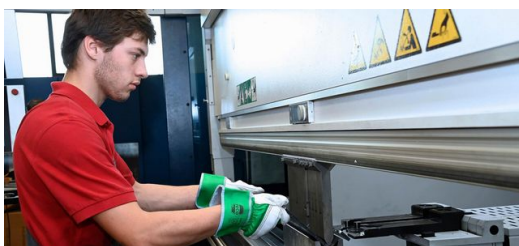
Assistance systems and software help with the work: The TruBend 5230 in use at the Fischer company.