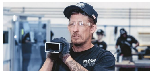
The right attitude: To work at PTL, you need commitment and the willingness to learn something new every day.