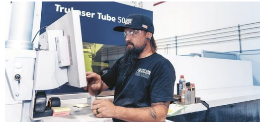
<p>Benchmark: PTL's lightning-fast turnaround times set it apart from many other U.S. job shops.</p>