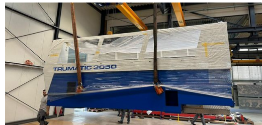
Heavy freight: The seven ton heavy bar arriving at the Matussek Metalltechnik assembly hall.