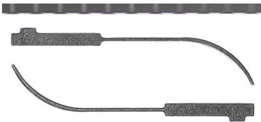
Picosecond lasers cut the most minuscule precision mechanical components; here, a second-stop spring for wristwatches made of 0.05 millimeter thick stainless steel.

Pawls are an example of this: their pinion and pinion wheel must avoid steel, because of its magnetic properties, and instead be made of silicon. These intricate, weight-saving designs cannot be manufactured with the same accuracy by any other means.