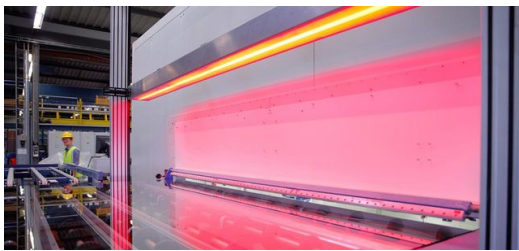
An ultrathin laser line — thinner than 100 micrometers — briefly heats the functional coating on sheets of glass to over 500 degrees.

Lorenzo Canova, RTP project leader at Saint-Gobain Glass Germany, says: "We were sure that a short, high burst of heat that heats only the coating and not the glass substrate can be accomplished only using a laser with high efficiency." The glass specialists developed a laboratory facility with a complex laser unit as its centerpiece. Using rapid thermal processing, they created a procedure that enabled them to verify their chosen approach. So far, so good.