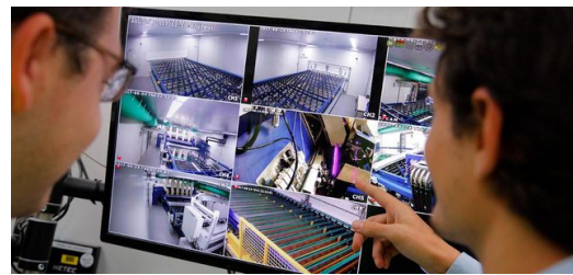
Heating the glass coating very briefly to a high temperature is an essential part of the hardening process. The glass experts at Saint-Gobain spent five years working on their rapid thermal processing method.