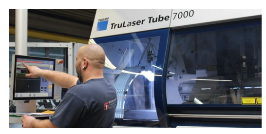
The finished program appears on the machine operator's terminal.