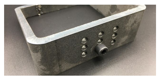
The TruLaser Tube 7000 can be used to fabricate a range of different threads in tubes

Since the summer of 2017, the company's plant in the Swabian Jura region has been using a test unit of the TruLaser Tube 7000 laser tube cutting machine with integrated tapping system. "We are delighted to be working with TRUMPF on this kind of collaborative project, and we are certainly impressed with the new technology," says Frank Steinhart. The CO2 laser cuts tubes and profiles without leaving burrs and offers bevel cuts of up to 45 degrees, diameters up to 254 millimeters and wall thicknesses of between one and ten millimeters.