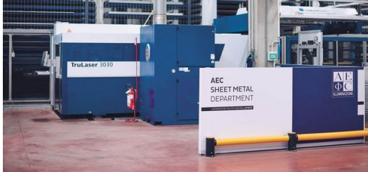
The TruLaser 3030 fiber 2D laser-cutting machine laid the foundations of AEC Illuminazione's close partnership with TRUMPF. Its connection to an automated storage system made production much faster.

achieve this, Bianchi has now connected up 85 percent of the company's machines. The MES generates production schedules and ensures smooth operation of the manufacturing environment. The design engineers can send their CAD drawings straight to the machines, where the data is imported and turned into finished parts as and when they are needed. The MES also collects machine data and key metrics for quality monitoring, machine utilization and production status. "By connecting everything together, we've created a truly transparent production environment. Tailoring our production schedules to the needs of our employees and machines helps to shorten throughput times and improve on-time delivery over the long-term," says Bianchi.