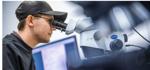
<p>Tireless efforts to enhance and innovate — that keeps customers happy and won the company a "Bavaria Best 50" award in 2023.</p>