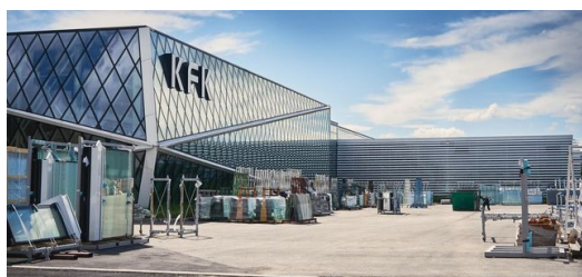
The KFK building in Croatia.