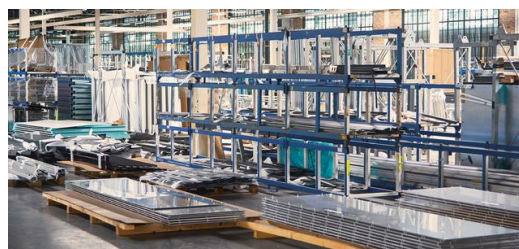
A one-stop service provider: KFK set up its own glass production facility measuring approximately 360 meters long in 2017.