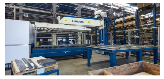
A Stopa storage system takes care of supplying materials while a LiftMaster makes it easier to handle parts.