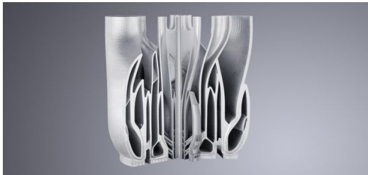
Simulations help clarify the physical processes involved in laser metal deposition and laser metal fusion and therefore improve the surface quality.

The 3D model explained above was extended to an LMD process with multiple layers on a single track to investigate the influence of fluid convection on melt pool formation and deposit build dimension. Unlike single deposition on a flat substrate, the laser beam and powder particles are projected onto a convex free surface as the layers are stacked. Due to Marangoni shear stress and particle addition, fluid circulation occurs in a melt pool with a convex surface. The simulation showed that the shape of the bottom of the melt pool continually shifts from flat to convex as the build height increases.