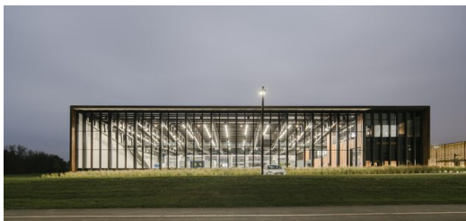
TRUMPF Smart Factory in Chicago, USA.

If Prouvé were to take a tour of the TRUMPF Smart Factory that opened in Chicago in 2017, his heart would probably skip a beat. The 45 x 55-meter cantilevered roof in this fully connected factory is supported by eleven steel trusses welded from individual pieces of steel. All the pieces were cut using the factory's own machines. As a result, visitors – and not just imaginary ones like Prouvé – can appreciate this roof as a great example of what the smart factory's machines can do and experience first-hand just how much laser machines can offer the world of architecture. So what might Prouvé have asked fellow architect Frank Barkow from the architects' firm Barkow Leibinger, which designed the TRUMPF Smart Factory? His first question would probably have been how the building could possibly have had a budget high enough to include such extraordinary structures. He would have been amazed to discover that it wasn't nearly as high as he might have expected—all because TRUMPF laser machines were on hand to cut and weld the steel trusses and make the whole roof construction financially viable.