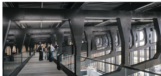
The roof of the production facility at the TRUMPF Smart Factory in Chicago is supported by eleven steel trusses, each made up of many individual