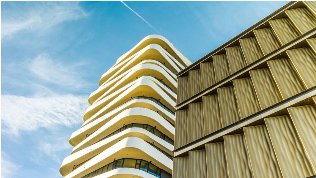
Multistory parking garage in Bietigheim-Bissingen

“Lasers are fast and flexible. We can use our systems for so many different things because they are so quick to reprogram,” says Geiger. TRUMPF demonstrates how these systems work together at its Smart Factory in Chicago. But what would Jean Prouvé have to say about laser machines as he gazed down on Industry 4.0 from the skywalk? Perhaps that he had always known the machine industry was capable of inspiring architecture? Maybe he would even see the TRUMPF Smart Factory as the successful realization of a fusion between industrial architecture and architecture from industry? Or perhaps he would simply be too flabbergasted to speak!