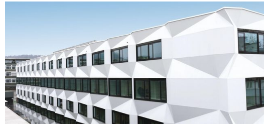
As painted: The facade of the University of Lucerne comes from BIGSTEEL.