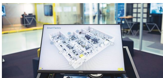
<p>Machine data collected by TRUMPF in its smart factory helps the computer vision team to train the AI.</p>

In this business model, TRUMPF's fully automated flagship is located at the customer's site, where it produces the desired parts; but control of the machine lies in the hands of a TRUMPF team at the Neukirch site in Saxony, which operates in three shifts, including at night. The cameras keep the team updated on every aspect of the machine's operation and deliver a non-stop stream of data. If a sheet-metal part gets stuck, the cameras record a short clip starting a few seconds before the event and ending a few seconds after. This helps the AI learn how to avoid such errors in the future. AI offers numerous potential benefits and uses, some of which are still in their infancy. Examples include more-efficient machine utilization, longer running times, higher part quantities, savings on materials, predictive maintenance and assistance systems. "There's a lot happening in computer vision at the moment," says Weiß. He is excited about 2024, which will introduce features such as smart cameras – some even with AI functions – to TRUMPF machines.