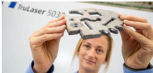
<p><span lang="EN-US">A worker checks a component she has chamfered using TRUMPF's EdgeLine Bevel technology. </span></p>