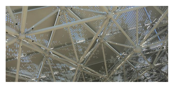
For the SoFi, A. Zahner used three TRUMPF machines to cut and punch 37,000 different panels with around 30 million irregularly distributed holes.