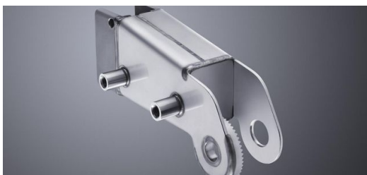
TRUMPF Medizin Systeme setzt in der OP-Tisch-Fertigung auf die Pluspunkte vom Laserschweißen.

This article was first published in May 2014.