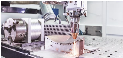
Time to process the order – a TRUMPF laser applies a metal layer onto a tool for a press in the automotive industry.