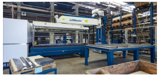
A Stopa storage system takes care of supplying materials while a LiftMaster makes it easier to handle parts.