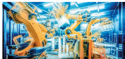
In manufacturing Industry 4.0 will lead to an unprecedented push for flexibility. Optical sensors and measurement devices will provide the data needed.