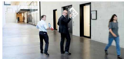
The team of people from the product group, development, purchasing, production, sales, service and project organization departments meets at regular intervals to discuss how development on the TruLaser Center 7030 is progressing.